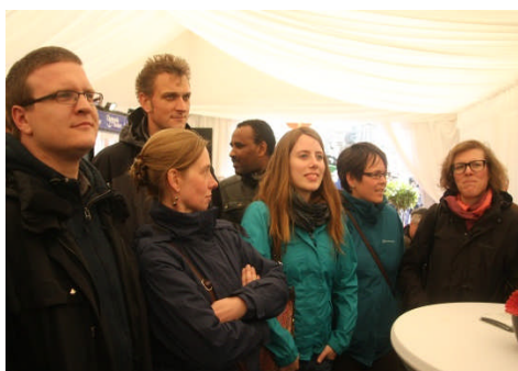
YP During their visit to "Oostende voor Anker"

On Mai 23 2013 a one day seminar on “ Renewal Energy ” was organised by the Belgian PIANC Young Professionals. This included a visit by boat to the wind-farms on the Belgian part of the North-sea. Unfortunately, due to the extreme bad weather circumstances, the trip to the windmills was impossible. So the festivity “Oostende voor Anker” was an alternative for the seminars attendees.