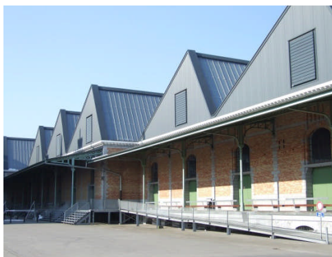
Ancient warehouses and sheds

On March 26 2013, the annual general assembly of PIANC-AIPCN. Belgium took place. About 92 members participated in the assembly. This year, it was the Brussels region that organised the annual meeting in the neighbourhood of the Port of Brussels, on a place where you can still find the ancient warehouses and sheds. The assembly itself took place in one of the marvellous old wine cellars of the port.