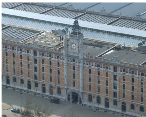
Tour & Taxis

The World Association for Waterborne Transport Infrastructure