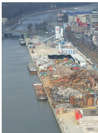
Port of Brussels from the top of the tower