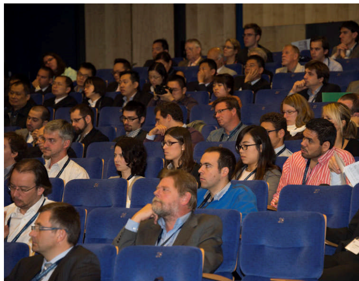
Smart Rivers 2013 : Maastricht Liège

The Belgian part took place in the city of Liège. You can find more details about this very successful organization in this yearbook.