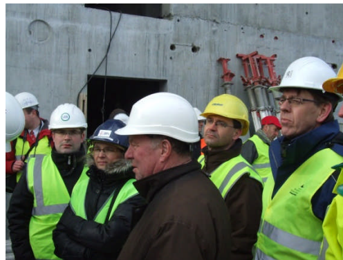
Top-information to the PIANC group

The lunch was served in the Royal Depot of Tour & Taxis.