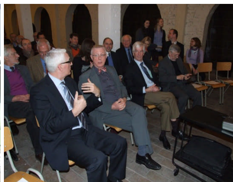
General assembly in the old wine cellars